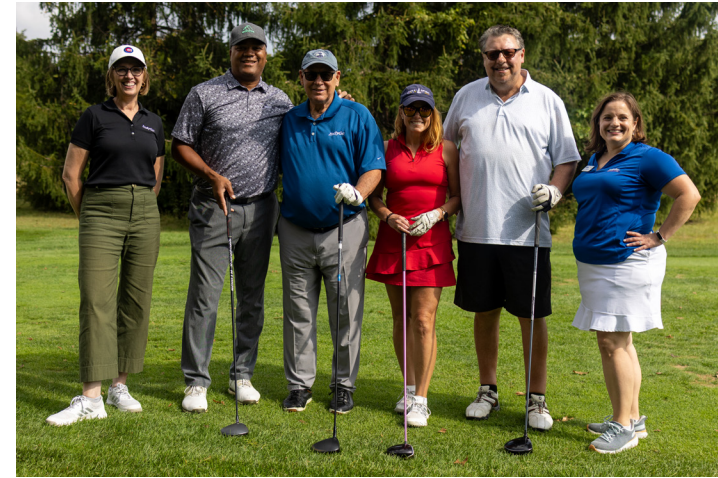
Thanks to the 175 golfers and 100 sponsors and business supporters, $85,000 was raised to support our work to reduce barriers and increase access to public transit.

Hosted the first Ride & Seek Scavenger Hunt on the bus, resulting in new and current riders learning how to better connect to their community .